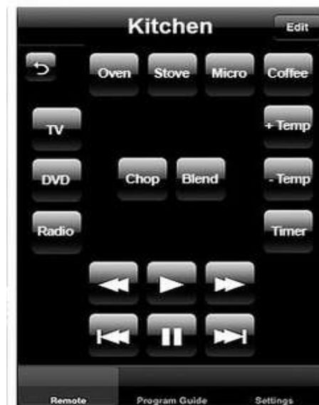
Figure3 :Femtocell enabled home devices

The potential of femtocells will doubtlessly raise some concerns among users — the number-one worry being security. It would be a hacker’s dream come true to be able to transcend cyber-space sabotage by controlling a victim’s physical appliances. The imagined possibilities of femtocells are as frightening as they are exciting. But new technology always introduces new fears, and if this foretelling becomes a reality, we’ll likely have adequate security measures in place by then