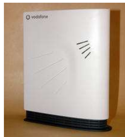
Figure2 :A Femtocell